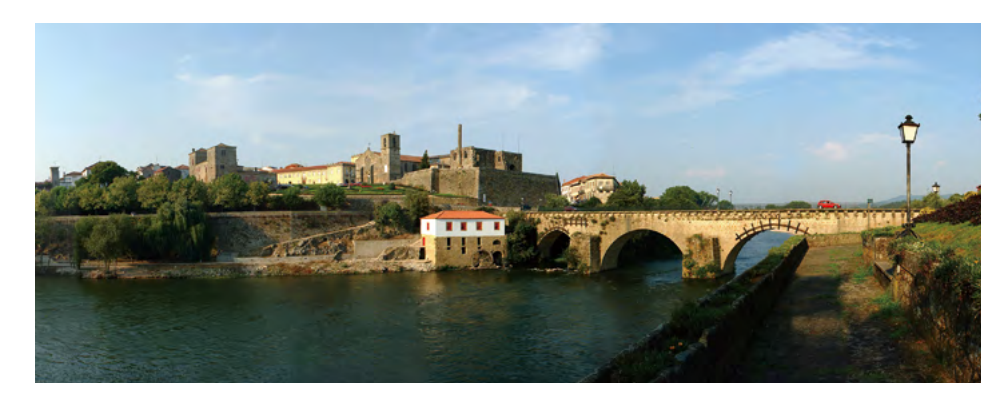
Panoramic of the historical center

The local economy is based on the traditional textile industry that employs roughly half of the local working population. Also, the crafts activity is a permanent occupation for roughly eight percent of the working population, with a considerable percentage working as a second job. Finally, Barcelos is well known for its mixed farming activities—the city is the largest national milk producer, and also strongly dedicated to wine making,